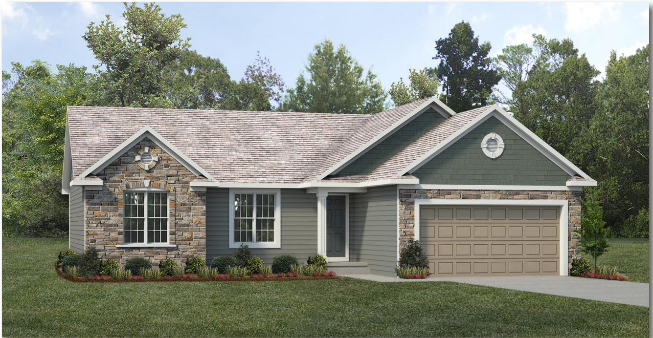
BASE ELEVATION WITH OPTIONS (Option FE1) OPTIONS SHOWN: Stone Walls/Accents, Shake Siding

Plans/Elevations/Images may contain options that are not included in the base price. All dimensions shown are approximate.