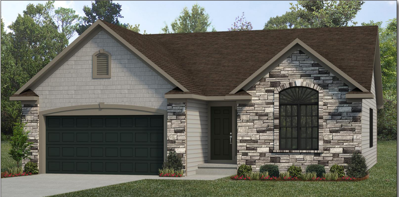
BASE ELEVATION WITH OPTIONS (Option FE1) OPTIONS SHOWN: Stone Walls/Accents, Shake Siding

Plans/Elevations/Images may contain options that are not included in the base price. All dimensions shown are approximate.