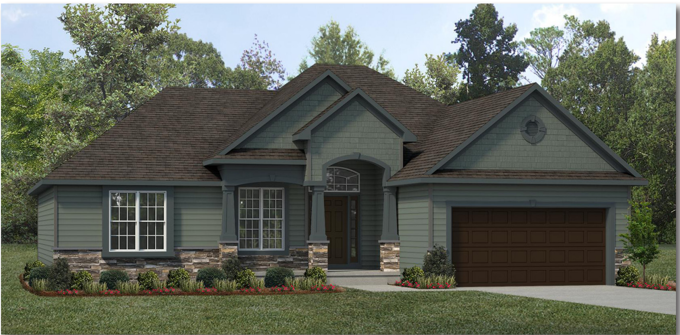
BASE ELEVATION WITH OPTIONS (Option FE1)

OPTIONS SHOWN: STONE WAINSCOT & PORCH POST BASES, SHAKE SIDING