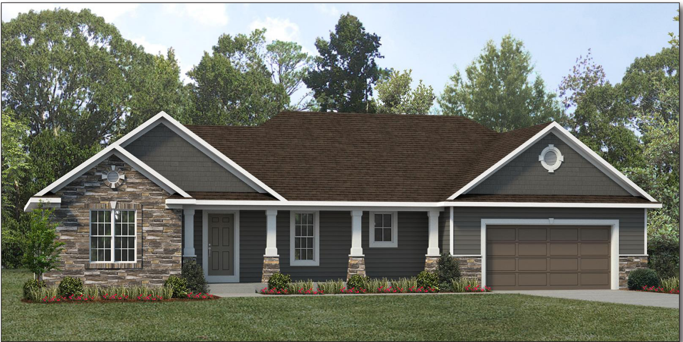
BASE ELEVATION WITH OPTIONS (Option FE1)

OPTIONS SHOWN: Stone Wainscot/Wall/Accents, Shake Siding