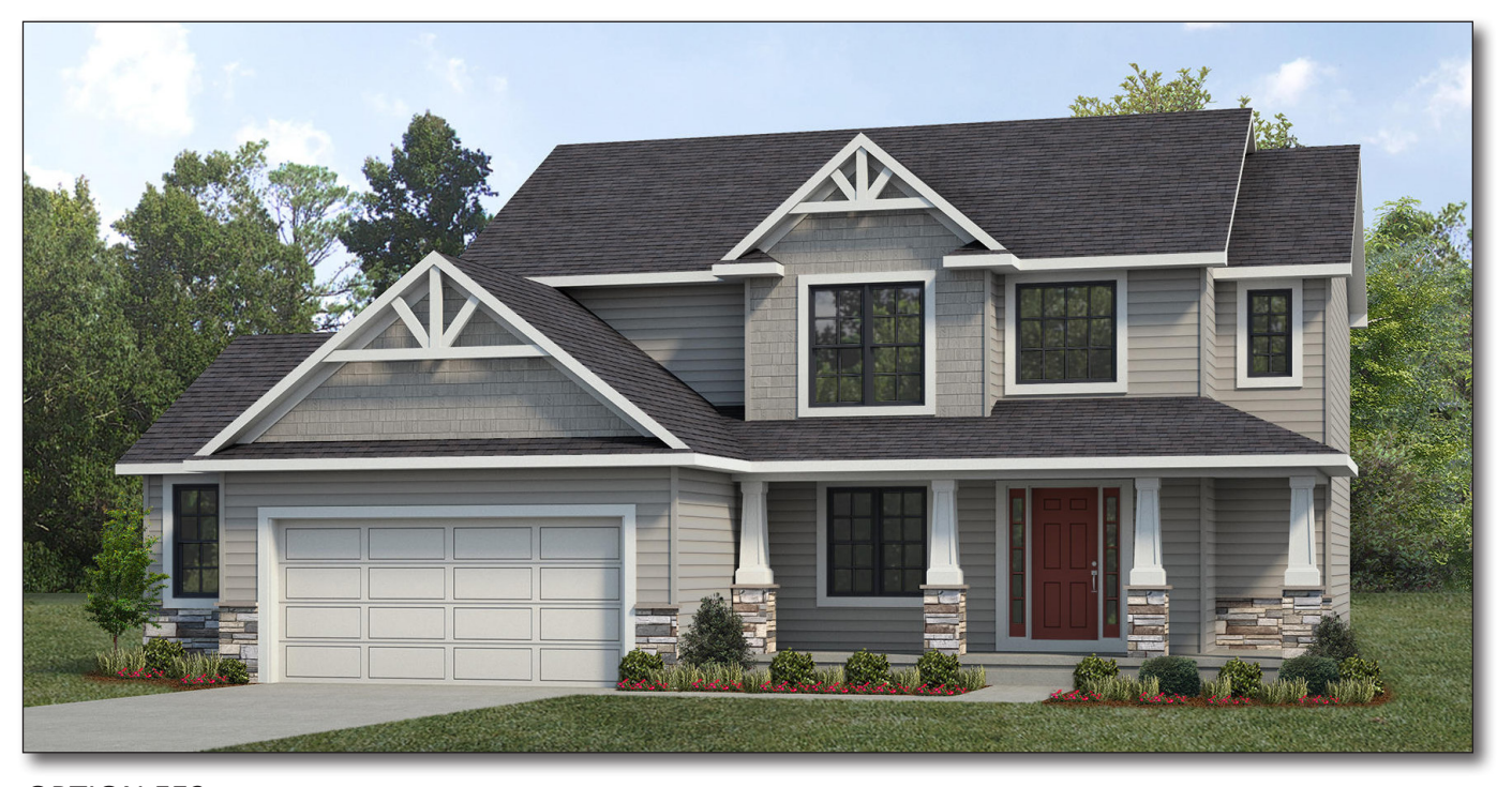
OPTION FE2 OPTIONS SHOWN: Stone Wainscot & Porch Post Bases, Shake Siding

Plans/Elevations/Images may contain options that are not included in the base price. All dimensions shown are approximate.